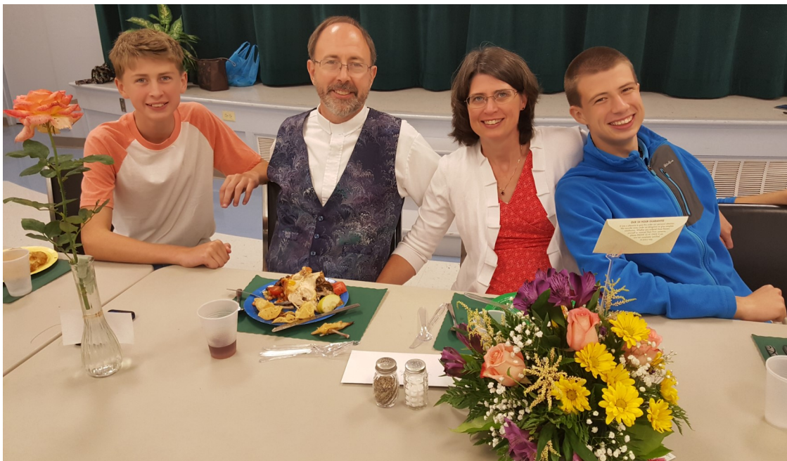
Our Pastor & Family on August 26, 2018