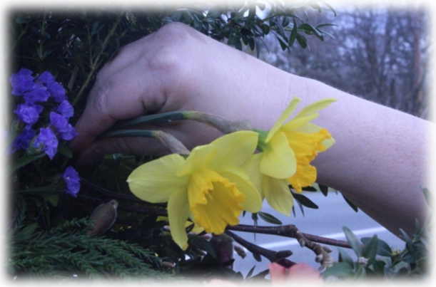
Decorating Cross on our lawn with flowers.