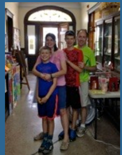
The family stands on the US-Canada border in Derby Line, VT.