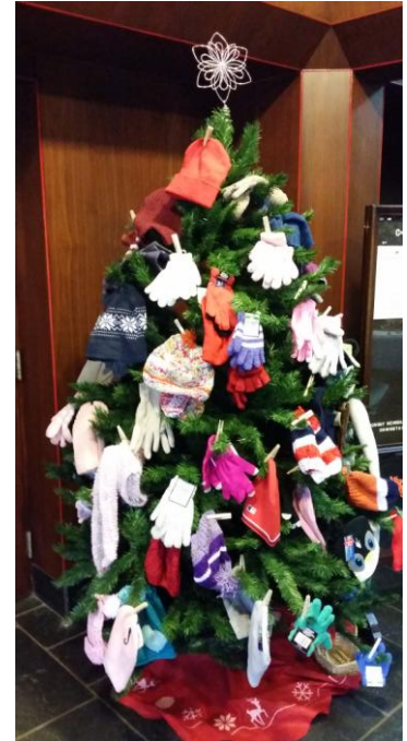
Thank you for all your donations to our Mitten, Hat & Scarf tree!