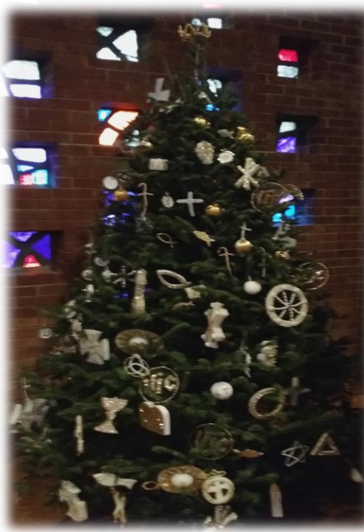
Our Chrismon Tree with Chrismons that were made by members and added this year.

We hope you enjoyed all of our Christmas adornments this season. Thank you to everyone who helped with everything from decorating, poinsettia arranging, wreath hanging and much more!